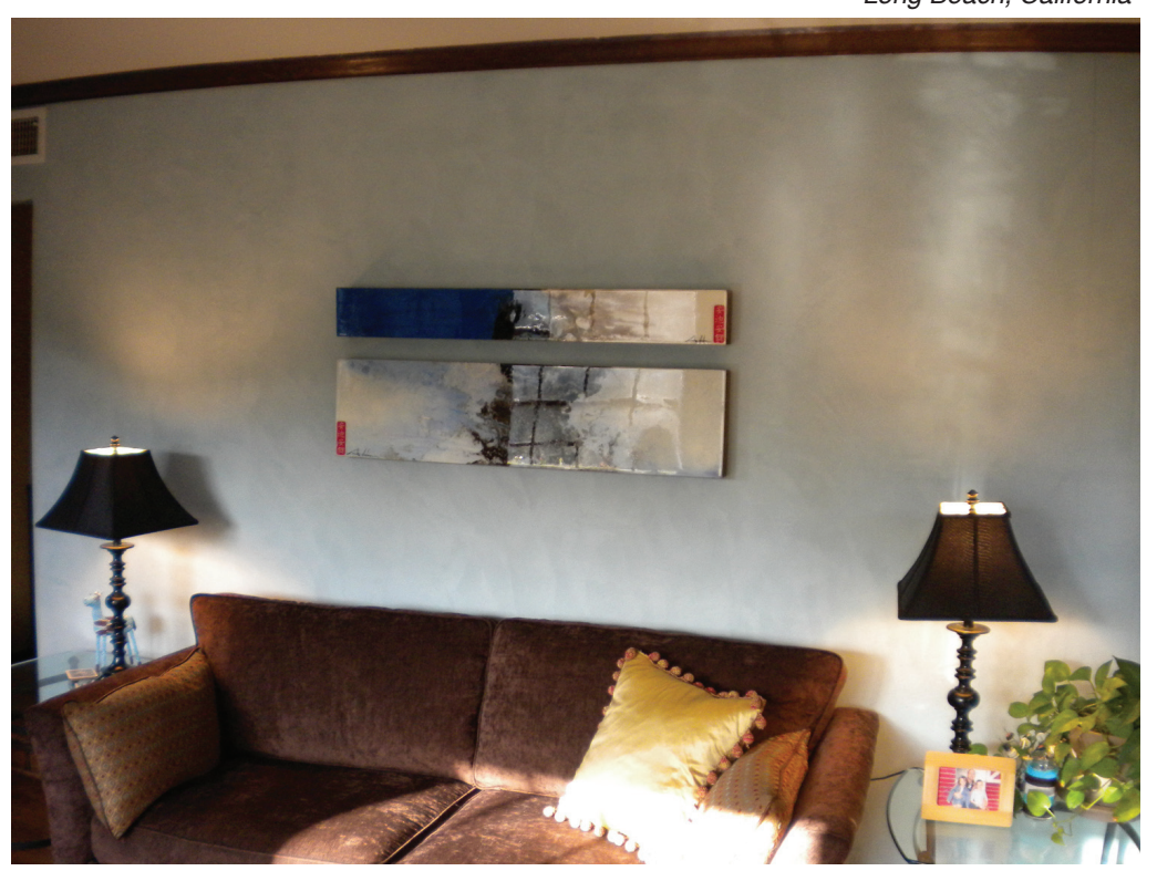
SAPONE SEALER over EPOCA MARMO V-2081