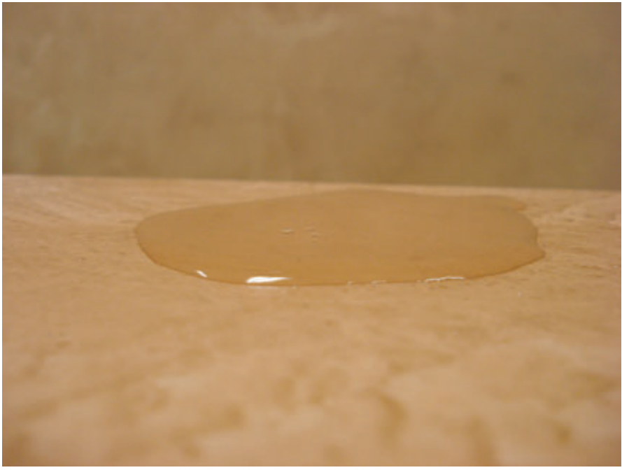
TERRA COTTA WATER BEAD