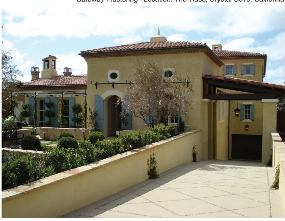
ANTIQUA V-591 over FINISH

Gateway Plastering Location: The Tides, Crystal Cove, California